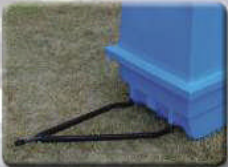
Optional rigid hitch for easy towing