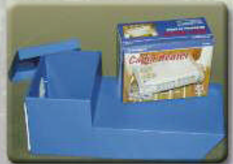
Deluxe, high-performance heater is enclosed in a moisture resistant box.

The entire unit is made of medium density polyethylene for long-lasting durability and easy cleaning.