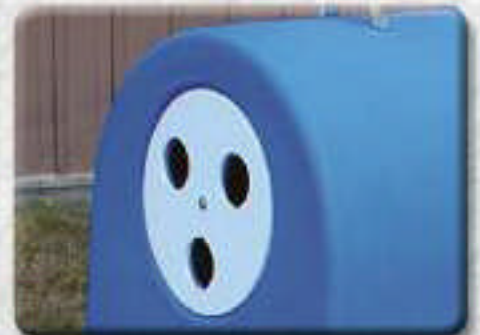
Vent/peep hole for proper ventilation and viewing