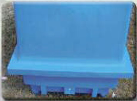
Bottom is ribbed, rounded on the front, and molded to accept an optional hitch for easy transportation.