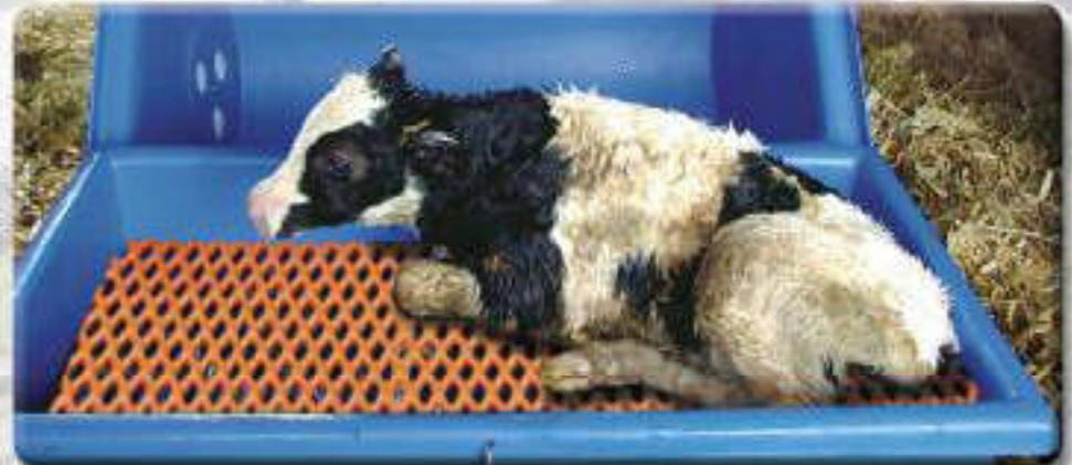
The PolyDome Calf Warmer provides a comfortable environment for newborn calves.

The PolyDome Calf Warmer provides a comfortable environment for newborn calves for the first few hours after birth. The top section is hinged, and removable, for calf entry. The floor is raised and slotted for easy heat circulation of the entire unit. There is a vent/peep hole on one end for proper ventilation and viewing the calf without opening the unit. The bottom is ribbed, and the front rounded, for easy transportation. The front is molded to accept an optional steel hitch for towing.