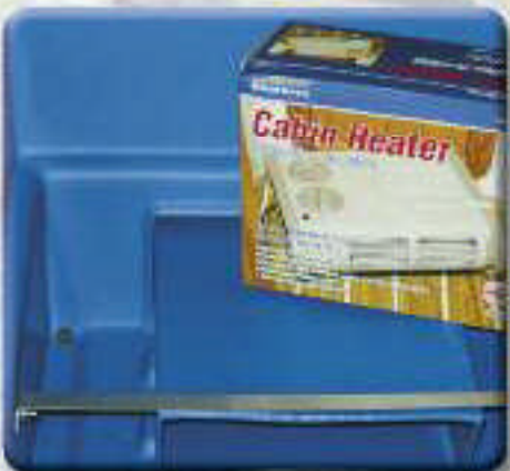
The raised, slotted floor allows for adequate warm air circulation. It can be lifted out for easy cleaning and disinfecting. PolyDome uses stainless steel for the supports.