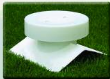
Optional Roof Vent