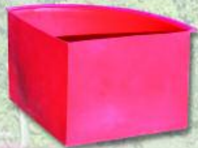
Optional Corner Feeder

The Mega Hut has several different door options and configurations to fit your needs: A full-height, double opening, 46" wide door (ideal for ostrich) is available. Or order our