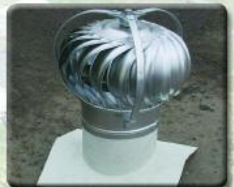
Turbine Fan with Adapter

With 5' extension panels you can add to the length at any time. Other options include roof vents, side vents, and a turbine fan that can be installed in the roof for superior ventilation.