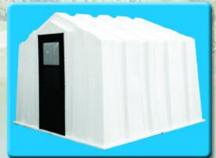
Mega Hut with user installed storm door