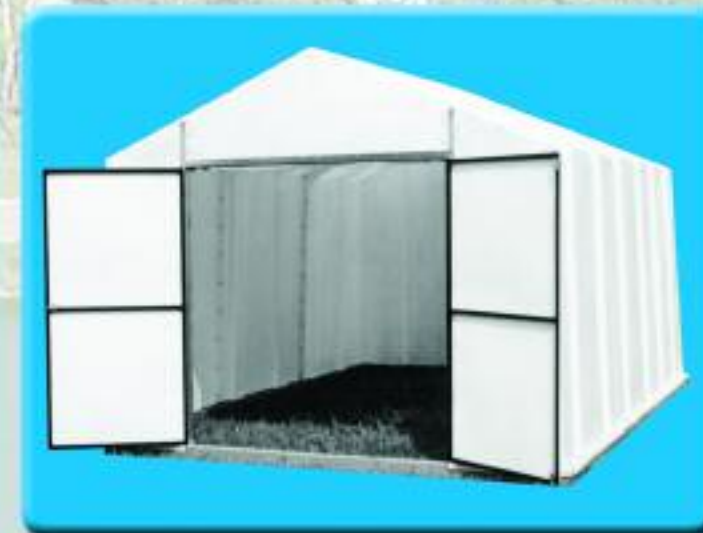
Mega Hut with optional 6' x 6' door kit.