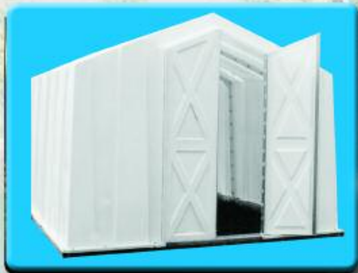
Mega Hut with full-height, double-opening doors.