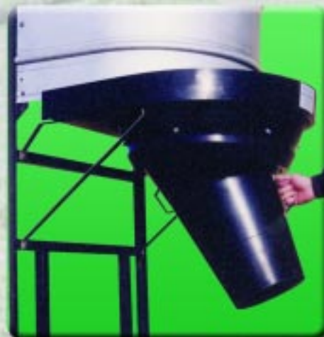
Removes easily for cleaning or silo chute access