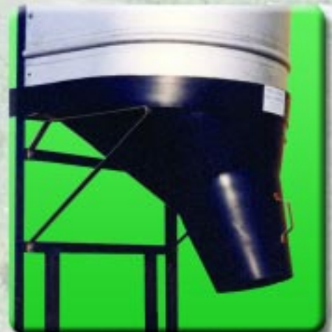
PolyDome Silo Hopper