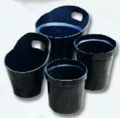
PolyDome Pails and Feed Buckets