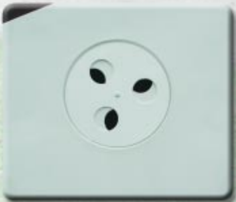
Standard Rear Vent

With 42" extension panels you can add to the length at any time. A rear center panel can be placed on the front to make a narrower, 30" x 60" opening. Or you can install our optional 5' x 5' door kit. Other options include roof vents, and a turbine fan that can be installed in the roof for superior ventilation.