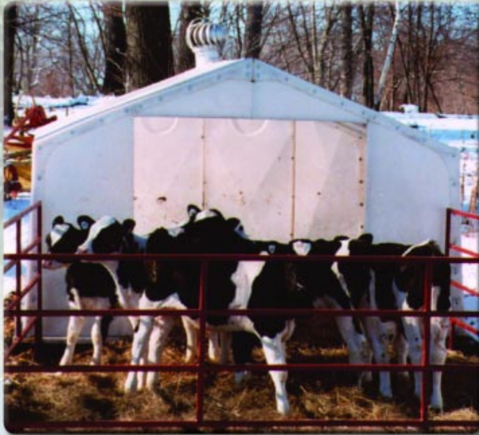
Super Hut with standard opening.

This large-size hut has multiple uses. The standard Super Hut comes in 4 quarter sections that assemble easily, to make a 10' x 7'6" x 6' tall building or add 42" extension panels to make it longer.