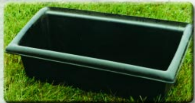
Optional Bunk Feeder