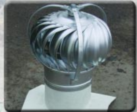
Turbine Fan with Adapter